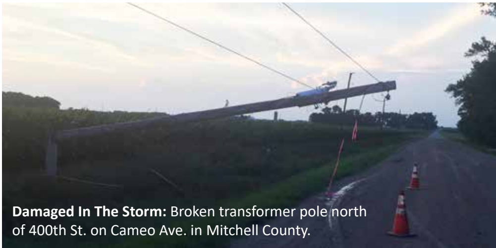
Damaged In The Storm: Broken transformer pole north of 400th St. on Cameo Ave. in Mitchell County.